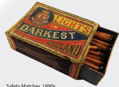
Safety Matches, 1890s. A collection of The Salvation Army International Heritage Centre, UK.

* You can read the poem 'Phosphor Poison' in 'The Darkest England Gazette, 27 Jan 1894' https://www.salvationarmy.org.uk/sites/default/files/resources/2019-09/no_31.pdf or Check on our Facebook and Instagram pages. ◀