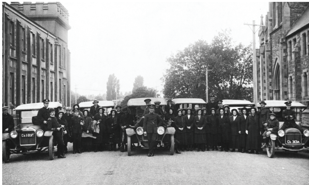
Christchurch City Corps Musical Group off to Oxford 1925

Transport has always played a role in The Salvation Army as it embarked on its mission to spread the Gospel. William Booth saw the advantage of the motorcar at a very early stage when he had a motor car painted white (when most other vehicles were black) and used it for open-air preaching. Whether it was a motor car, ambulance, cart, horse, or even just a simple bicycle, transport was at the heart of the Army's work. This collection of photographs shows the use over time of various means of transport by Salvationists and Corps as they undertake their mission. ◀