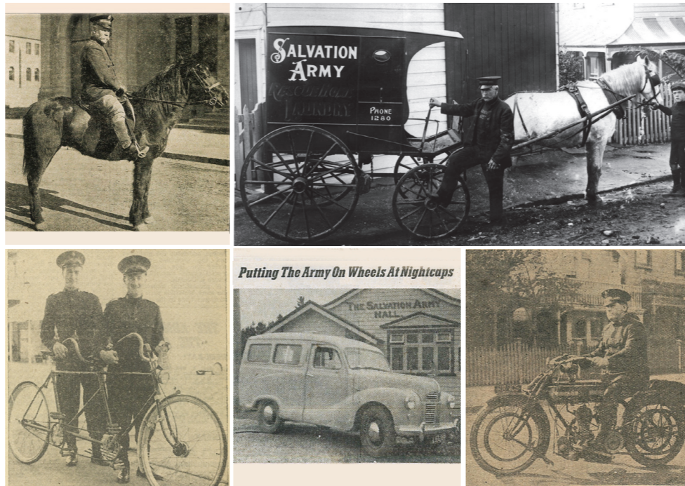
Putting The Army On Wheels At Nightcaps

Transport has always played a role in The Salvation Army as it embarked on its mission to spread the Gospel. William Booth saw the advantage of the motorcar at a very early stage when he had a motor car painted white (when most other vehicles were black) and used it for open-air preaching. Whether it was a motor car, ambulance, cart, horse, or even just a simple bicycle, transport was at the heart of the Army's work. This collection of photographs shows the use over time of various means of transport by Salvationists and Corps as they undertake their mission. ◀