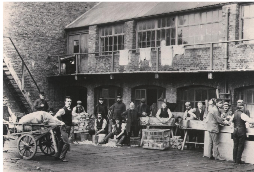
Workers at The Salvation Army's match factory in London, UK, 1899

William Booth was a man who not only wrote inspirational words on social reform, but also put these words into practise.