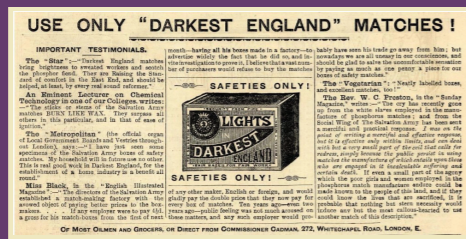
Advertisement for Darkest England Matches, Darkest England Gazette , 3 March 1894