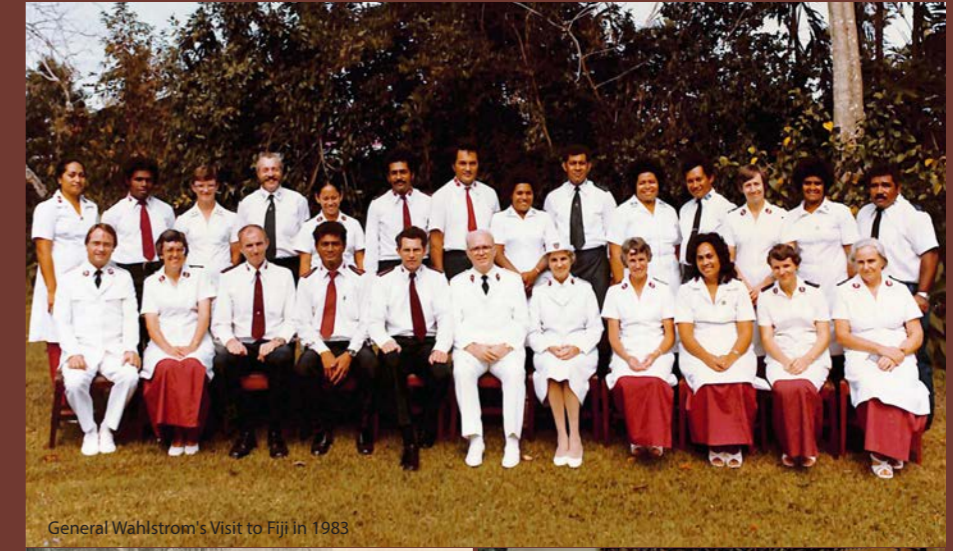
General Wahlstrom's Visit to Fiji in 1983

General Wahlstrom, General Burrows, and General Larsson's Visit