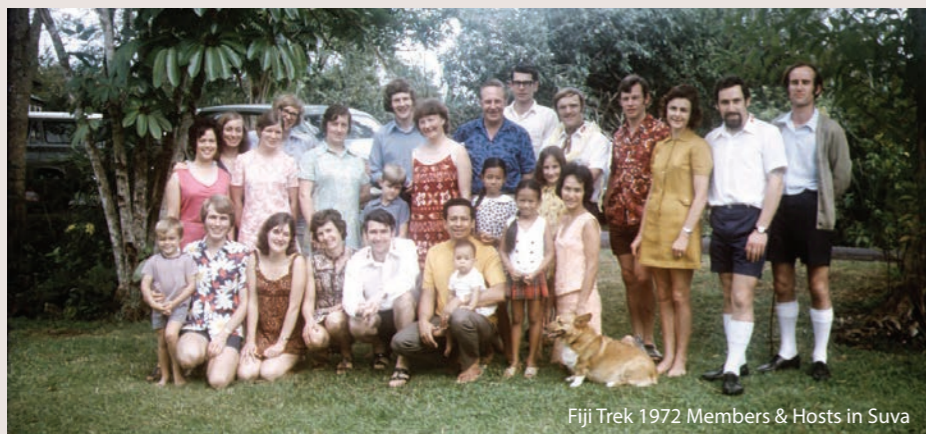
Fiji Trek 1972 Members & Hosts in Suva

Student Evangelistic Trek to Fiji in 1972