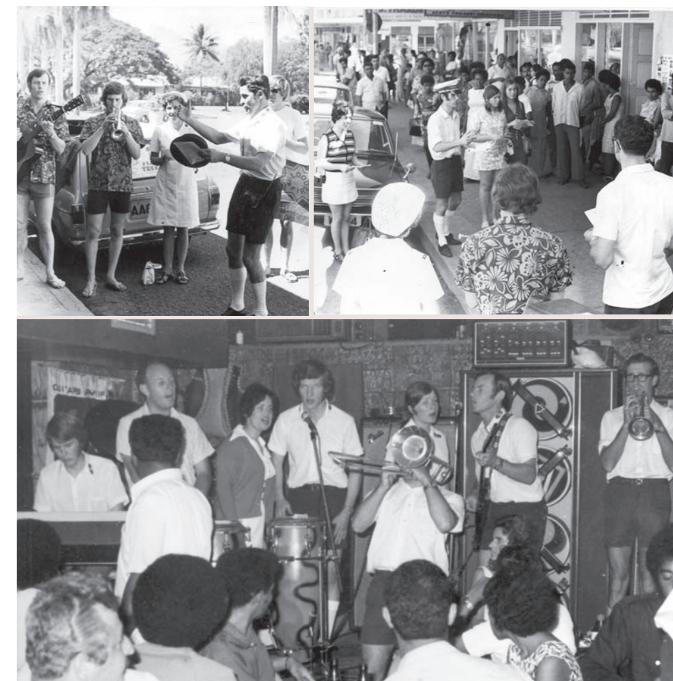
Top: Open-air meeting in Suva, Bottom: Meeting in a Suva Nightclub