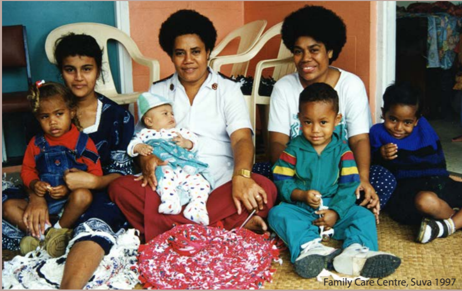
Family Care Centre, Suva 1997

Community and Social Services Programmes Past and Present