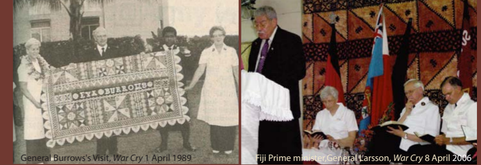
General Burrows's Visit, War Cry 1 April 1989