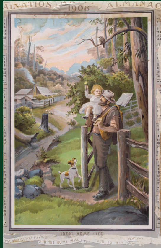
1908 TSA Almanac poster >

▶ Traditionally, The Salvation Army produced an almanac calendar every year available with the Christmas edition of The War Cry . They featured art, often scenes painted specifically for the almanac, images from Salvation Army institutions or photographs of picturesque New Zealand scenes. The almanac images over the years creatively provide a snapshot of social history and artistic trends within the time period they depict. Some of the original watercolour artwork depicted in the almanacs has been preserved in the Archives. ◀