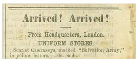
The War Cry 5 January 1884 pg4.

► The Red Guernsey was a notable clothing feature during the early years of The Salvation Army. It was an unusual fashion choice by The Salvation Army when Victorian England fancied black.