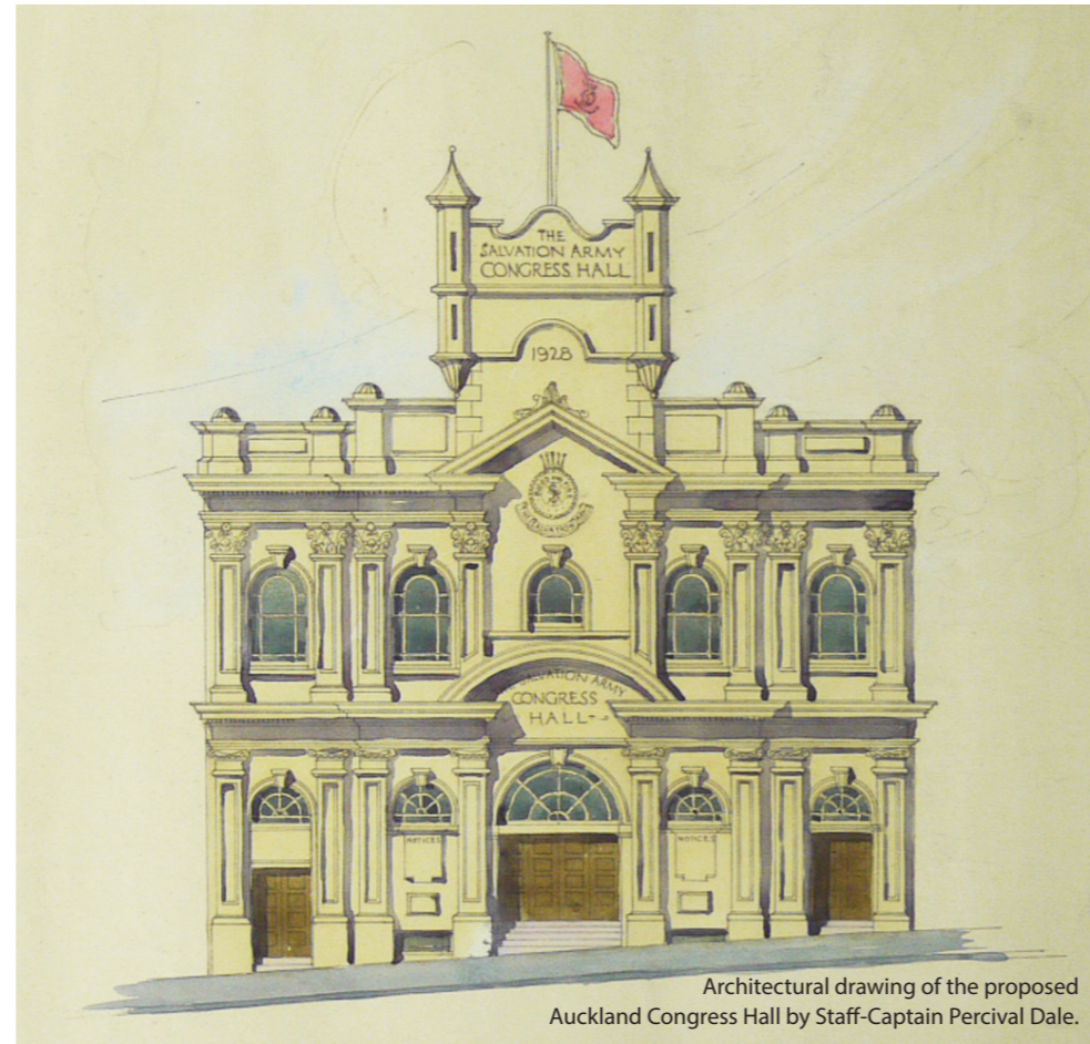
Architectural drawing of the proposed Auckland Congress Hall by Staff-Captain Percival Dale.

Auckland Congress Hall, Grey's Avenue, Auckland