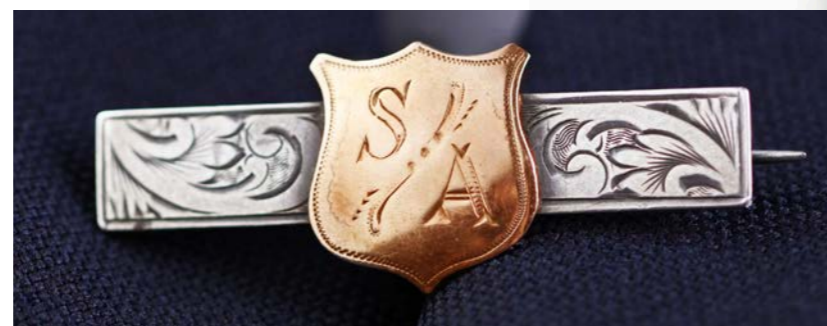
SA brooch with I Knight engraved on the reverse